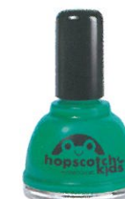
Nail Polish in Eenie Meenie Miney Moe ($19.90) Hopscotch Kids Doll up with no fuss.