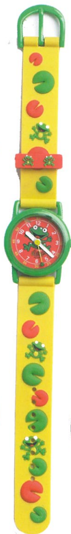
Frog Watch ($49.90) Bugzz Kids What's the time, Mr. Frog?