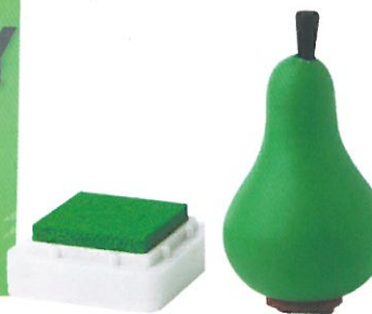
Wooden 3D Stamp: Cute Pear ($8.90) Kikki.K Give the stamp of approval.