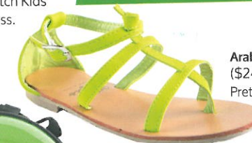
Arabella Sandals ($24.95) Cotton On Kids Pretty kicks.