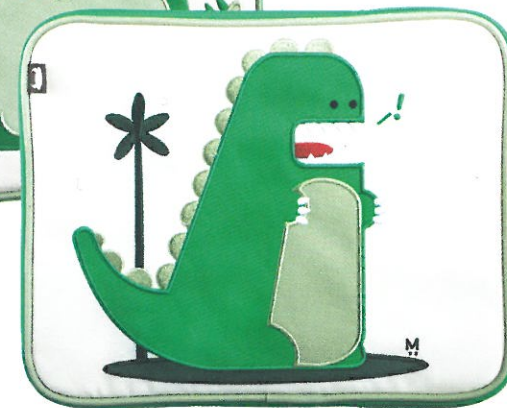
Beatrix NY Percival T-Rex iPad Case ($54.90) Tinydipity.com T(echie)-Rex.