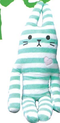
Striped Bunny ($65.90) Artbox Cuddle up.