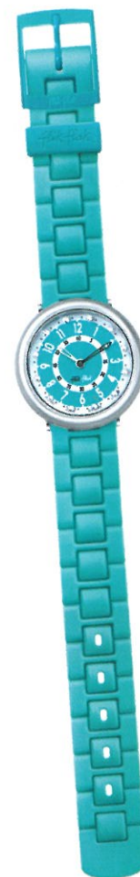
FlikFlak Sola Green Watch ($69) Swatch Never have a bad time.

Watch others go green with envy with these items for your child.