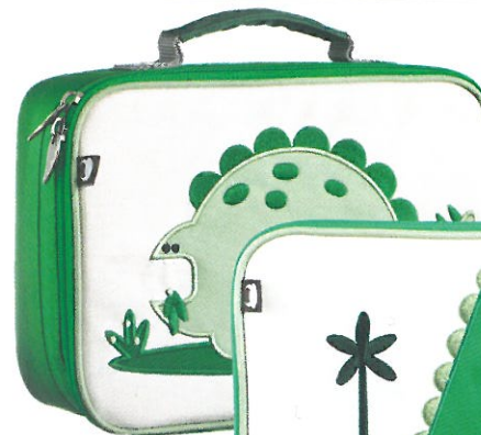
Beatrix NY Lunch Box Alister Dino ($58.80) Tinydipity.com Chomp on this.