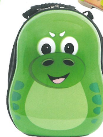
Cuties & Pals Trolley Case and Backpack ($159) Motherswork For the little monster's travels.