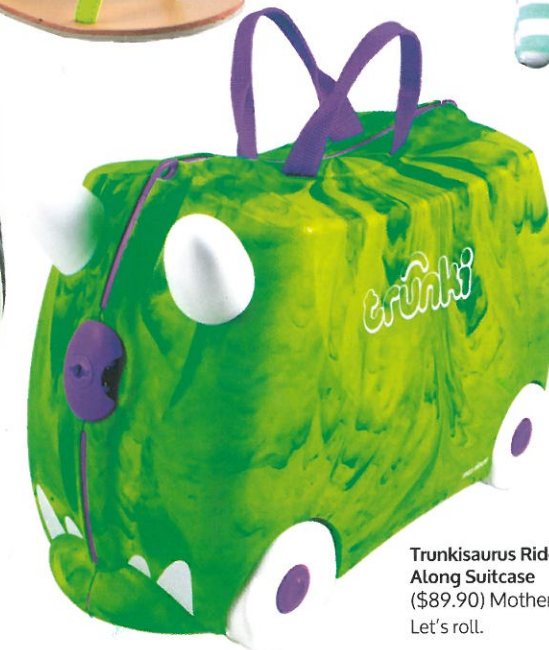
Trunkisaurus Ride On, Pull Along Suitcase ($89.90) Motherswork Let's roll.